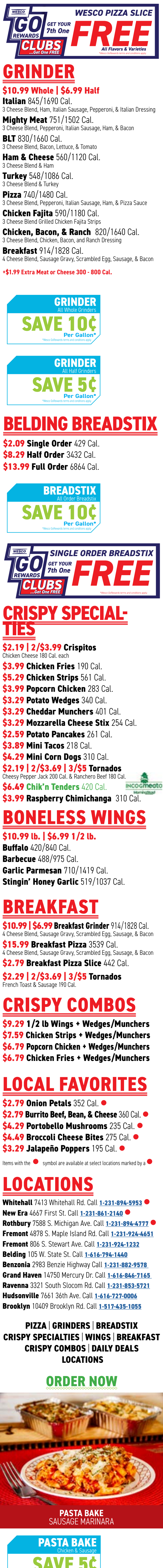
PASTA BAKE SAUSAGE MARINARA